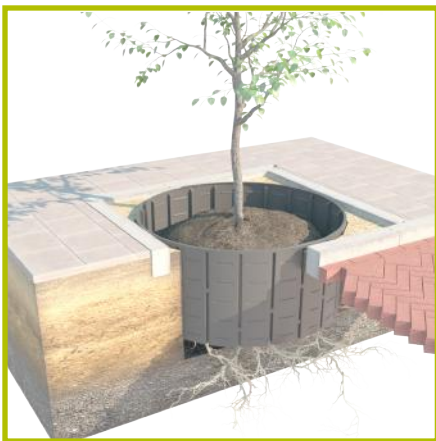
Circular Formation Ribbed Root Panel

Due to the nature flexibility of the system, the gt Ribbed Root Panels can be folded up to a 90 degree angle allowing for a number of configurations to be created for different tree planting scenarios. (See Below)