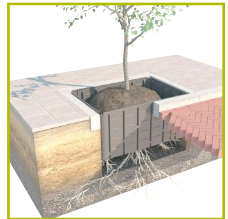
Square Formation Ribbed Root Panel