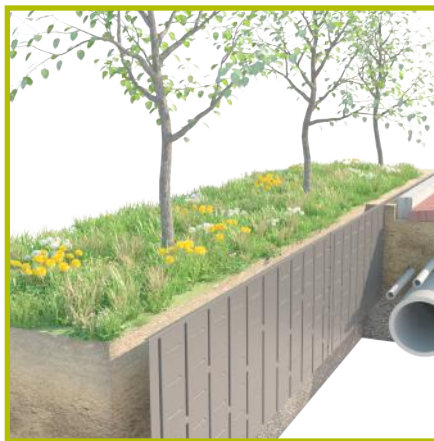
Linear Ribbed Root Panel