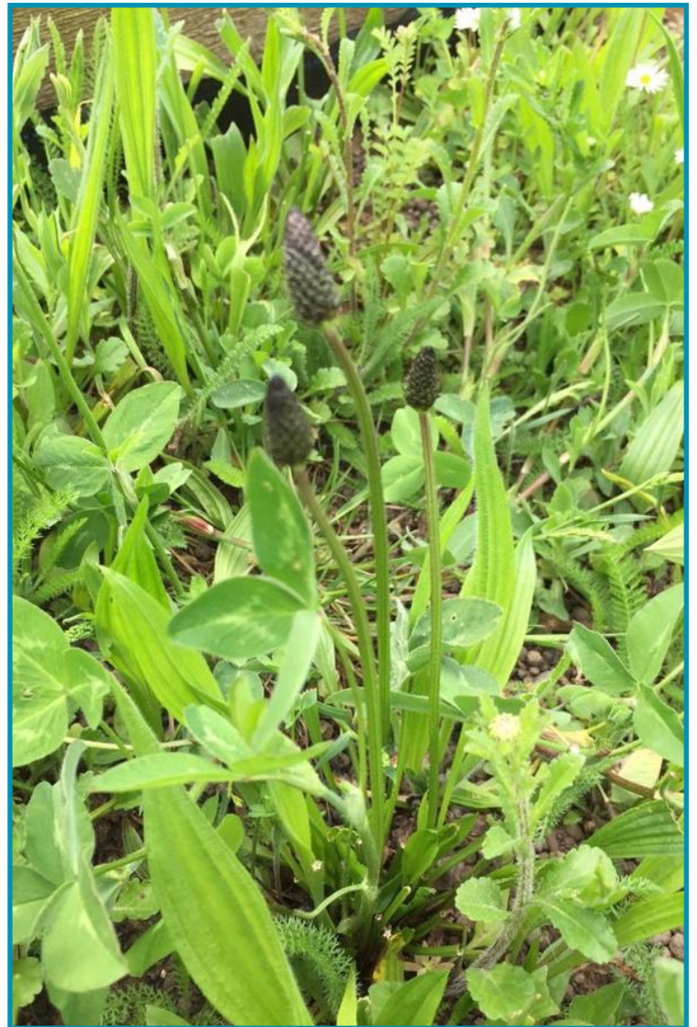
Figure 1 - Early growth of the John Chambers Green Roof Mix